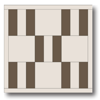
Jane Stickle Colorway